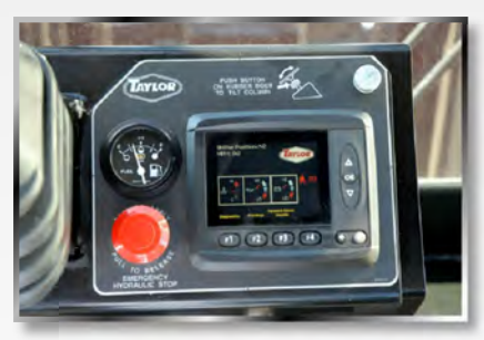
Easy to understand diagnostic display. TICS (Taylor Integrated Control System) using CANbus technology is standard on the TX Series.