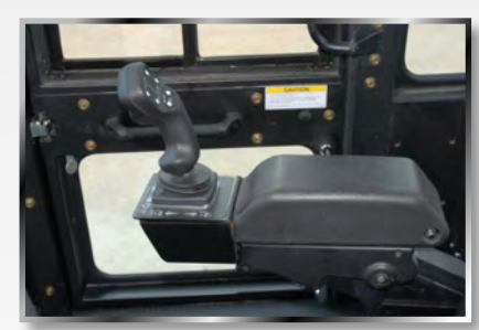
Comfortable adjustable arm rest with fingertip joystick control for smooth precise handling

The TX 4030 features a spacious, all steel cab with increased leg and head room, sound deadening rubber mat flooring, tilt steering wheel, simple T-shaped dash with hinge down instrument panel, fingertip electric joystick controls, and optional climate control system for operator comfort and convenience.