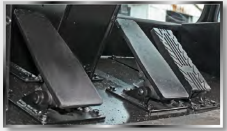
Two brake pedals left – brakes and inching right – brakes only